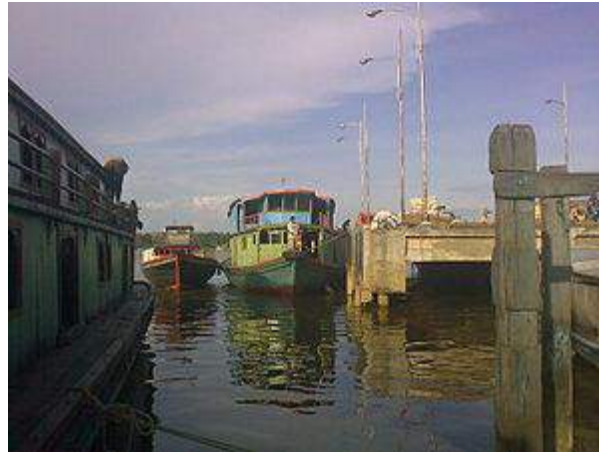
Activities at the Kahayan river pier in Central Kalimantan 4

Paskah Suzetta said that currently the river transportation is mostly carried out by the community, especially in areas where road infrastructure is not yet available. River transportation has the advantage of being relatively cheap, but its use has diminished especially in areas where road and bridge infrastructure has been built 5 .