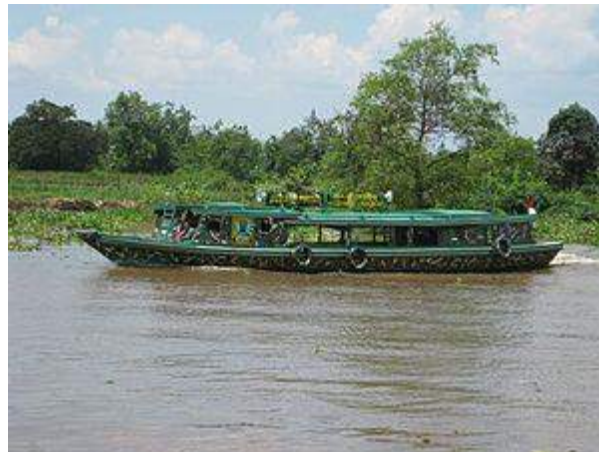
A water bus that operates on the Barito river

Paskah Suzetta said that currently the river transportation is mostly carried out by the community, especially in areas where road infrastructure is not yet available. River transportation has the advantage of being relatively cheap, but its use has diminished especially in areas where road and bridge infrastructure has been built 5 .